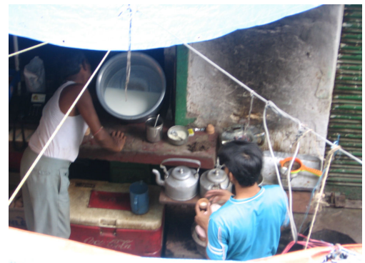
Right: A Chai walla's street stall, note the small disposable clay cup the customer is using.