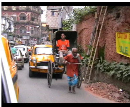
Left: A hand pulled rickshaw