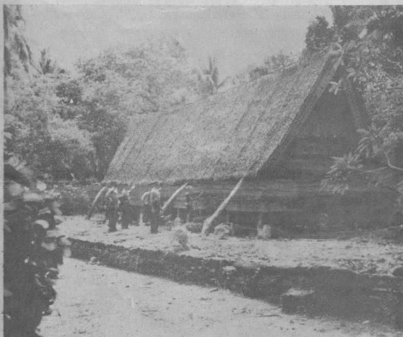
Wildcats Inspect Native Council House Kayangel Islands Dec. 1944