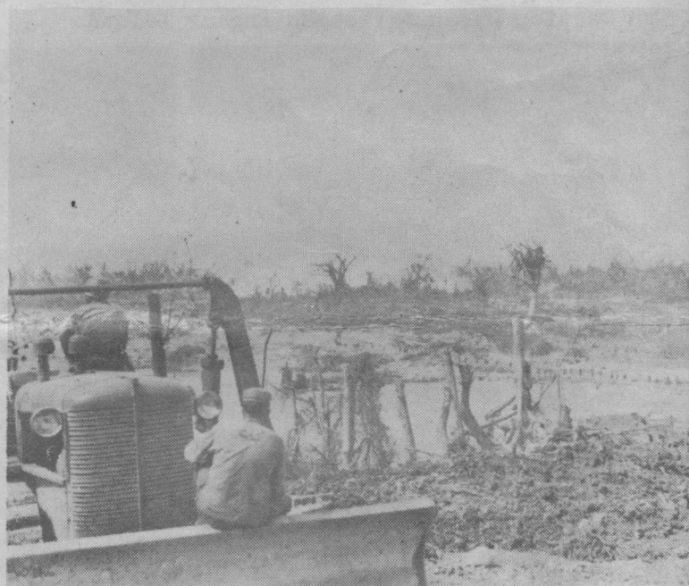
Bulldozer Crew Watch Troops Move Across Wildcat Bowl Angaur Island Dec. 1944