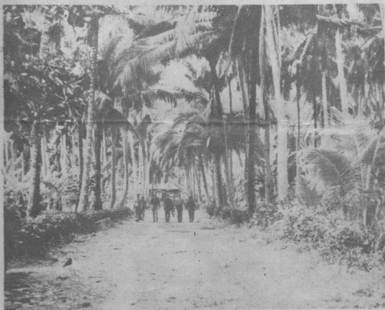
Palm Lined Avenue, Kayangel Islands, Dec. 1944