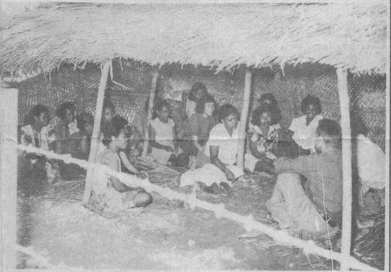
Wildcats teach Angaur natives English in Civilian Compound, Oct. 1944

Pictures on this and the following page have been approved for publication by the Chief Base Censor and may be mailed home.