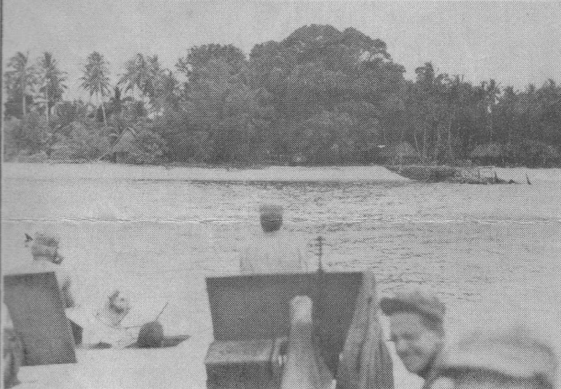
Offshore view of Kayangel Village as landing craft move toward the stone pier Dec. 1944