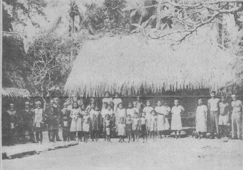
The natives of Kayangel Village turn out for a picture, Dec. 1944