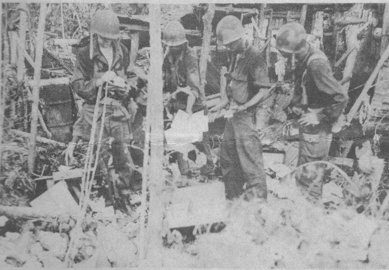
Searching the rubble of Middle Village, Angaur, Sept. 1944