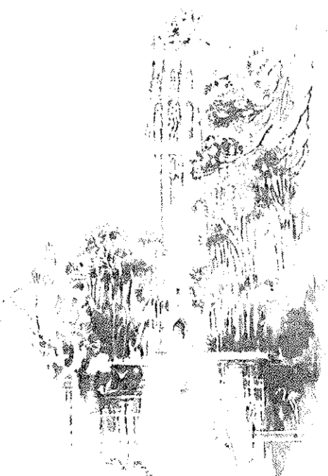
Box Singing Tower