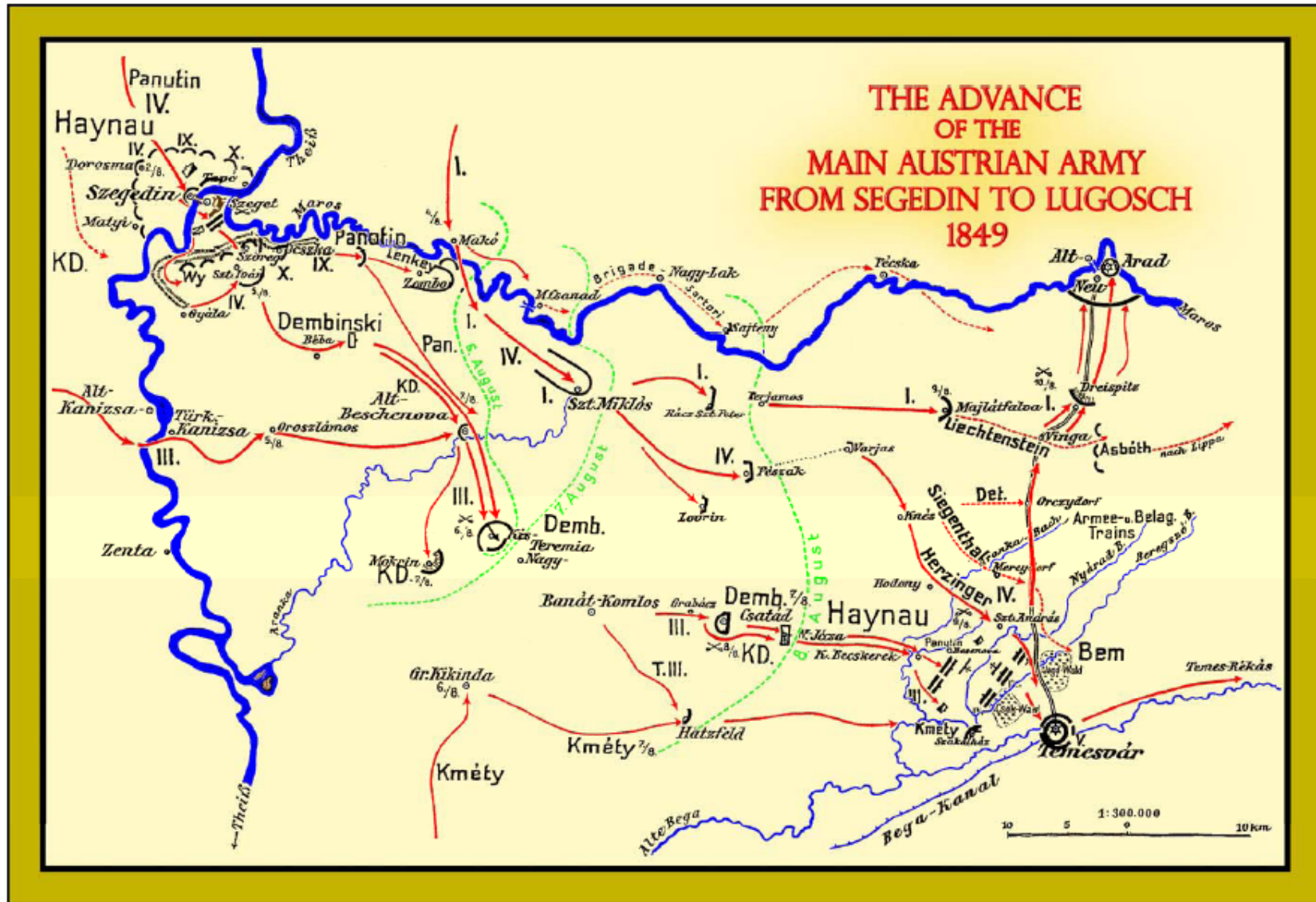
MAP OF THE ADVANCE OF THE MAIN AUSTRIAN ARMY 1849