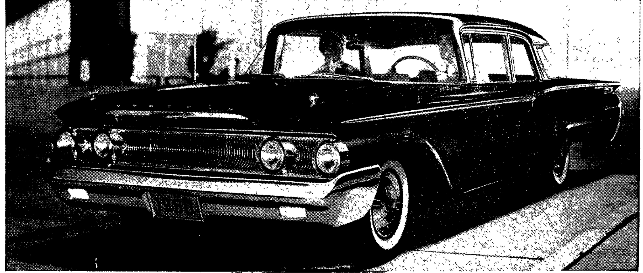
1960 Mercury Monterey 2-door Sedan with deluxe interior and complete carpeting at no extra cost.

NOW THIS MERCURY MONTEREY DELIVERS FOR ONLY $72 MORE THAN "LOW-PRICE NAME" CARS WITH THE SAME EQUIPMENT.*