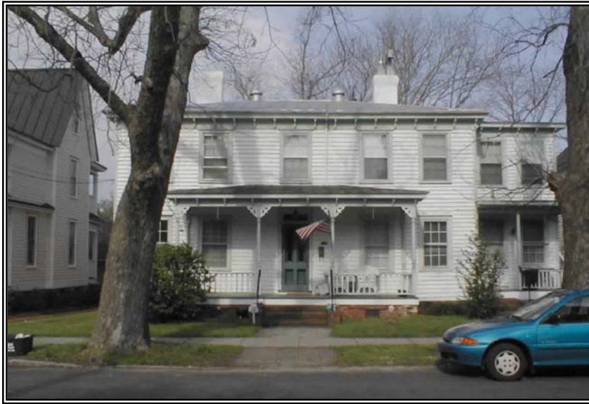
Figure 50 Clara and Haliburton Foscue Home

In the 1930s Hal and Clara Foscue moved to New Bern. Hal Foscue worked as a rural mail carrier for the postal service. 5 They made their home on East Front Street in New Bern, and eventually the home became a series of apartments and the daughters and family also lived in the E. Front Street home. Hal and Clara Foscue are buried in the new extension of Cedar Grove Cemetery in New Bern. 6