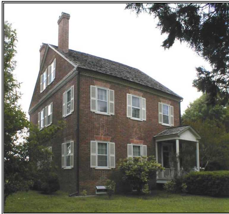
Figure 70 The Simon Foscue House, 1804

See Appendix D, Excerpts from The History of Jones County.