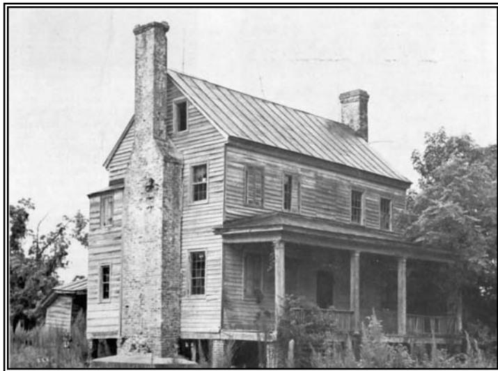
Figure 75 Photo of Hickory Grove