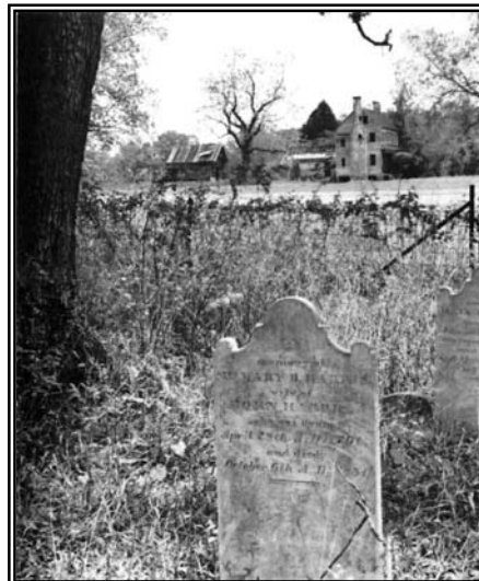
Figure 77 View from Lane Cemetery at Hickory Grove

The John T. Lane family resided on the south side of Core Creek near Harris Landing in Craven County. A wealthy, influential family of the area, the home was known as Hickory Grove. In 2002, only the old cemetery remains of the homestead. 25