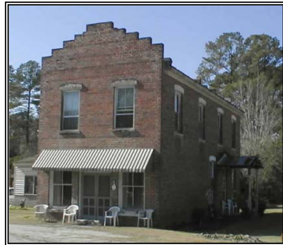
Figure 99 Joe Register Store, 1880