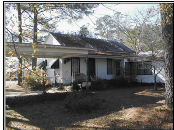
Figure 100 Robert Pittman Home, 1888