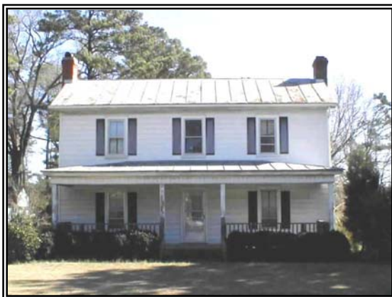
Figure 97 L. Wetherington Home and A. Wetherington Store