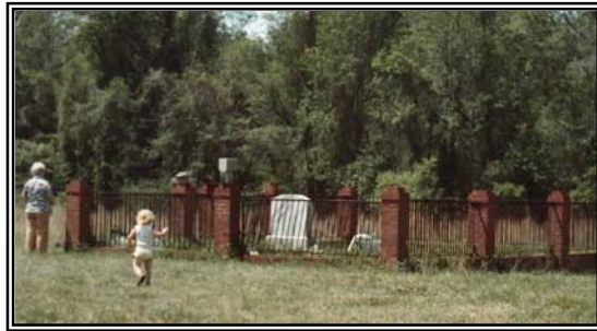
Figure 104 Humphrey Cemetery, Clarks, NC