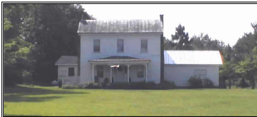
Figure 103 McKeel Farm House