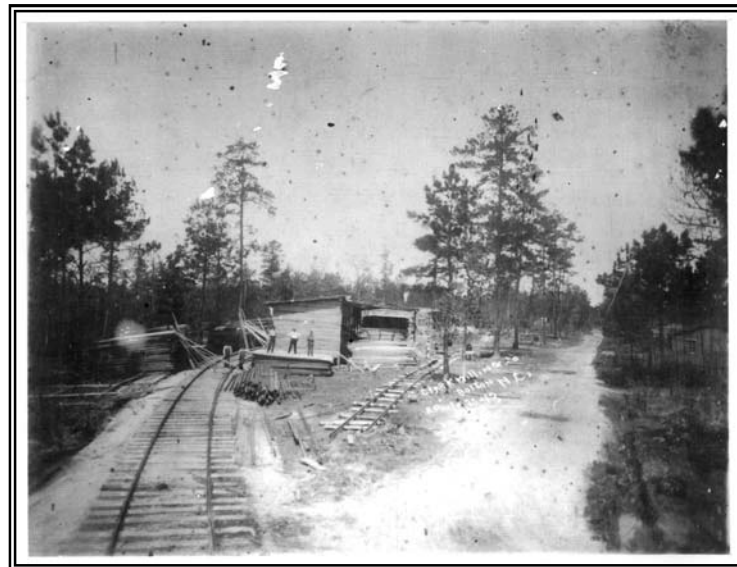
Figure 94 Clarks Lumber Co, 1913