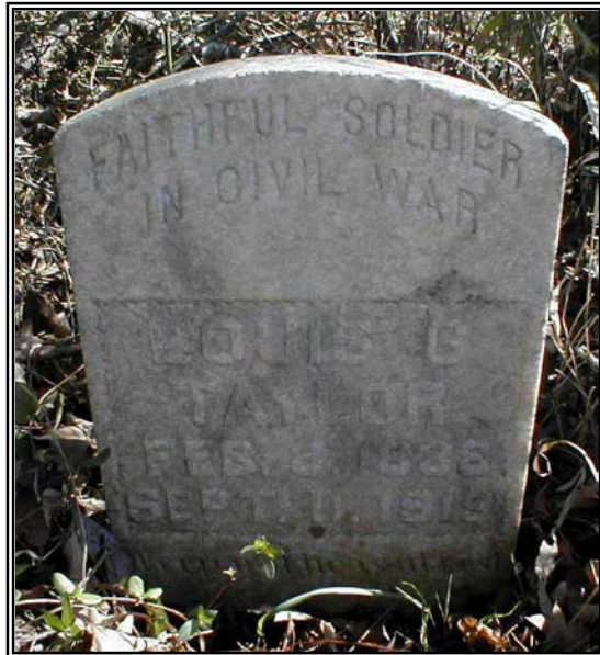
Figure 106 Louis G. Taylor Gravestone

30. Louis G. Taylor gravesite is located in the Craven County Industrial Park south of the US 70 bypass. The solitary grave (1838-1919) of Louis G. Taylor is marked 'faithful soldier in civil war'. 26