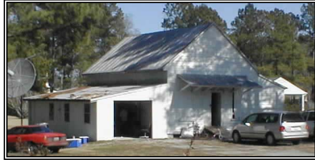
Figure 96 George Stewart Home and Stewart General Store