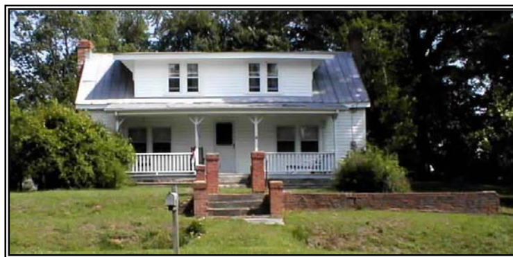
Figure 101 George T. Eubanks House, 1917