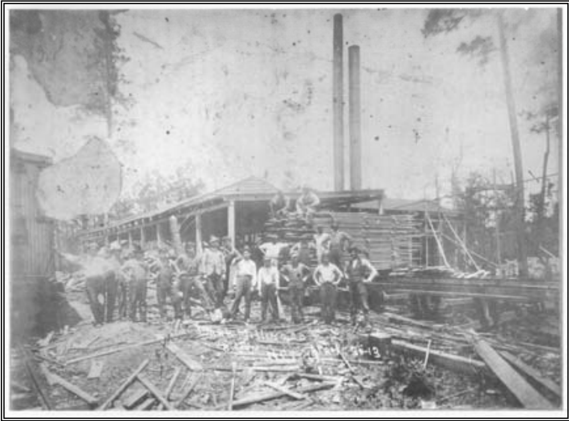
Figure 23 The Clarks Milling Company, 1913