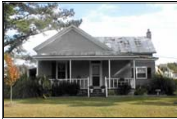
Figure 32 Levi Norris Home, Tuscarora