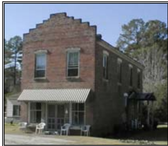
Figure 66 Joe Register Store, 1880