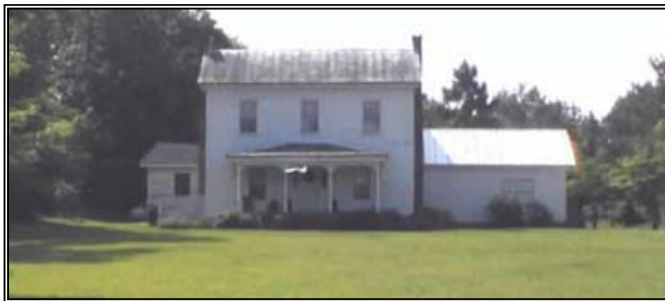
Figure 70 McKeel Farm House

23. McKeel Farm. Once a dairy farm, the bulk of the property was acquired for the US 70 Bypass and the home moved nearby. The McKeel home, a two-story frame house built in 1920 still stands in 2002 on Clarks Road. 23