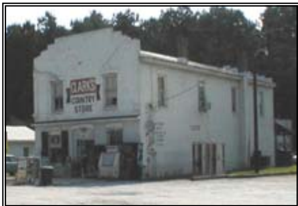
Figure 64 Lehman Wetherington Home and Wetherington Store