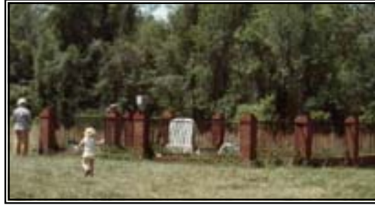
Figure 71 Humphrey Cemetery, Clarks, NC