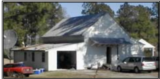
Figure 63 George Stewart Home and Stewart General Store