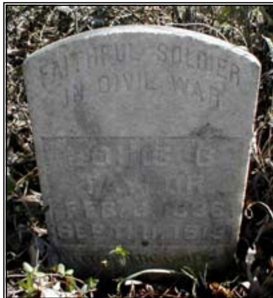
Figure 73 Louis G. Taylor Gravestone

29. Louis G. Taylor gravesite is located in the Craven County Industrial Park south of the US 70 bypass. The solitary grave 1838-1919 of Louis G. Taylor is marked 'faithful soldier in civil war'. 27