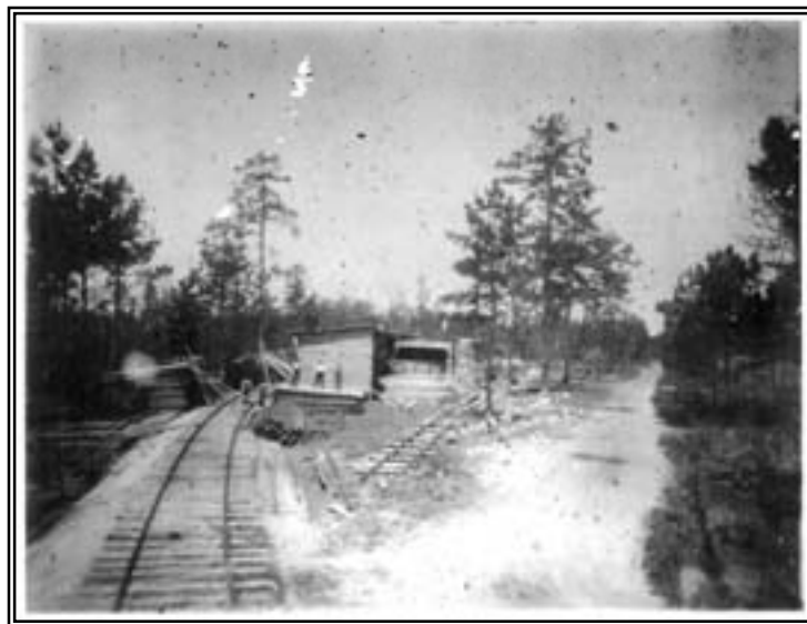
Figure 61 Clarks Lumber Co, 1913

The Abbott and Jones Brickyard operated about 1905 and became the Carolina Brick Company, and relocated to Hyman's Siding. The Clarks Lumber Company operated about 1910, one of the several lumber camps operating in the area of Clarks. A lumber milling business also operated in Clarks in 1911 but the location of the old mill is unknown.