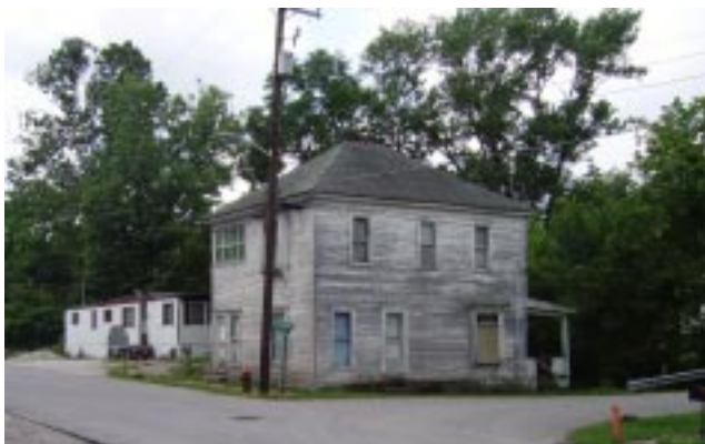
Old structure in Marengo at the corner of Jefferson and Depot streets.