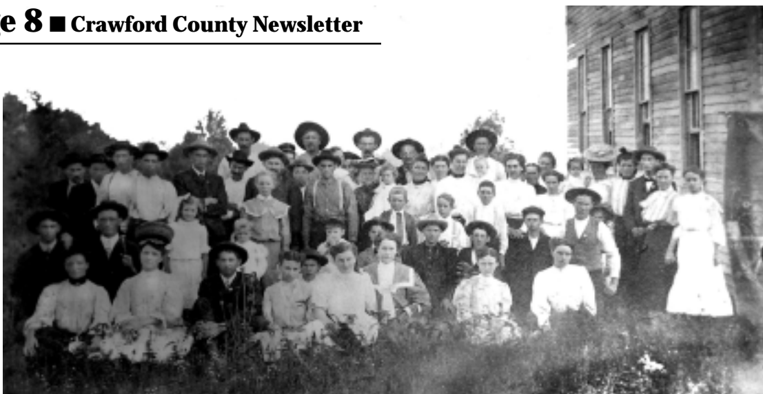
Gathering at the Riddle Church which included some of the Ballard Family.