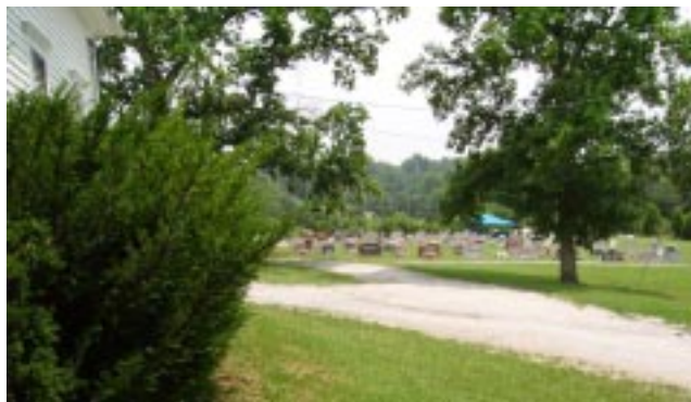
Union Chapel Church & Cemetery, site of the CCHGS July meeting.