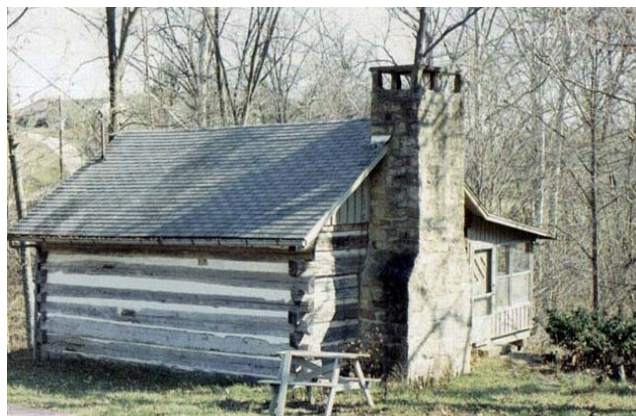
Thomas Stroud Cabin