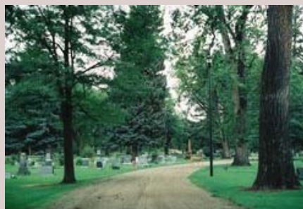
Added by: Bonzo32