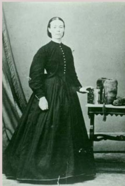
Added by: Bonzo32