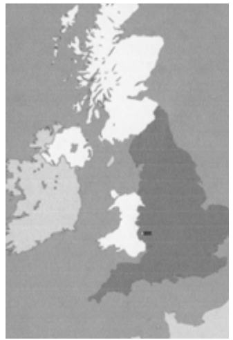
Worchester (see black

The earliest record of this place (1087) describes a town with a castle, a cathedral, and a small settlement, all surrounded by a wall and deep ditch. Except for the cathedral, dwellings were made of wood, with low thatched roofs, walls of planks, and an open hearth in a floor of wood, earth or gravel. It was at this location in 1265 the Battle of Evasham between the land barons and the Royal forces firmly established that there were laws even for the king. Even though the Royal army won this battle, a belief in the law and a growing national unity was developing in the minds of our people. By the middle of the sixteenth century the Warner name was recorded in a number of English parish baptismal records.