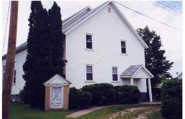
1872 Friends Church built on the site of the original church