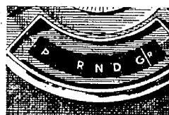
New Life . . . New Letters . . . in Your Driving Life

For this is the automatic with triple turbines. One for quicksilver starts from a standstill. Another for cream-smooth cruising. And a third turbine that teams up with the other two for passing response that's safer all the way.