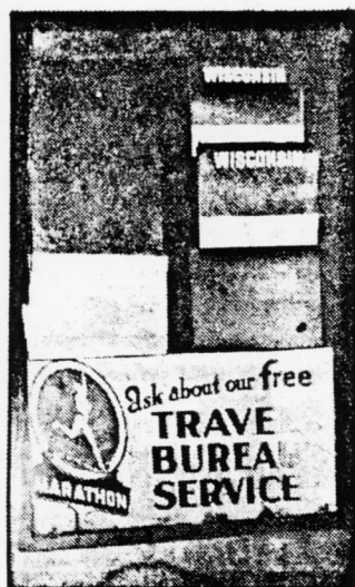
Travel tips for customers in this spot since 1937.