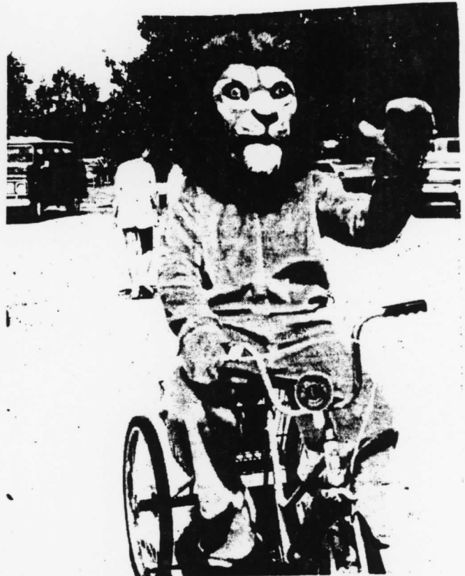
The Lions Club Lion pedalled his way through Daleville's festival parade and didn't roar once. He was a favorite with parade-watching children.