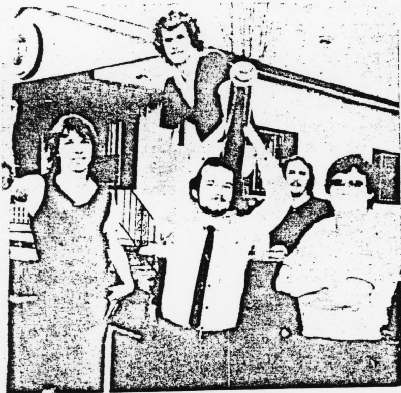
The five members of the top 40 band "Nightwind" will also perform for the Daleville Birthday Festival.