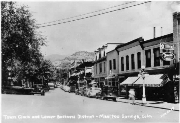
Town Clock and Lower Business District - Manitou Springs, Colo.