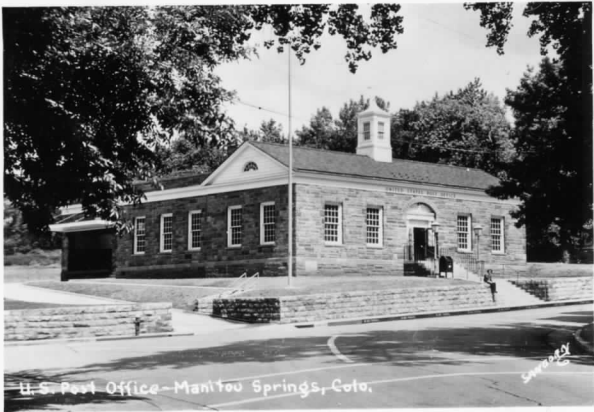
U.S. Post Office - Manitou Springs, Colo.