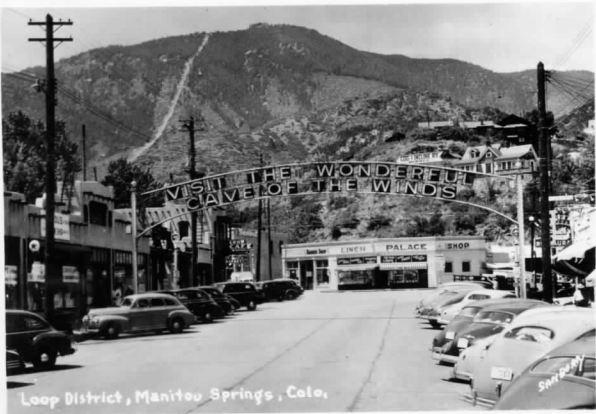
Loop District, Manitou Springs, Colo.