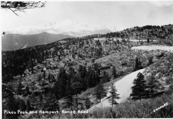
Pikes Peak and Rampart Range Road