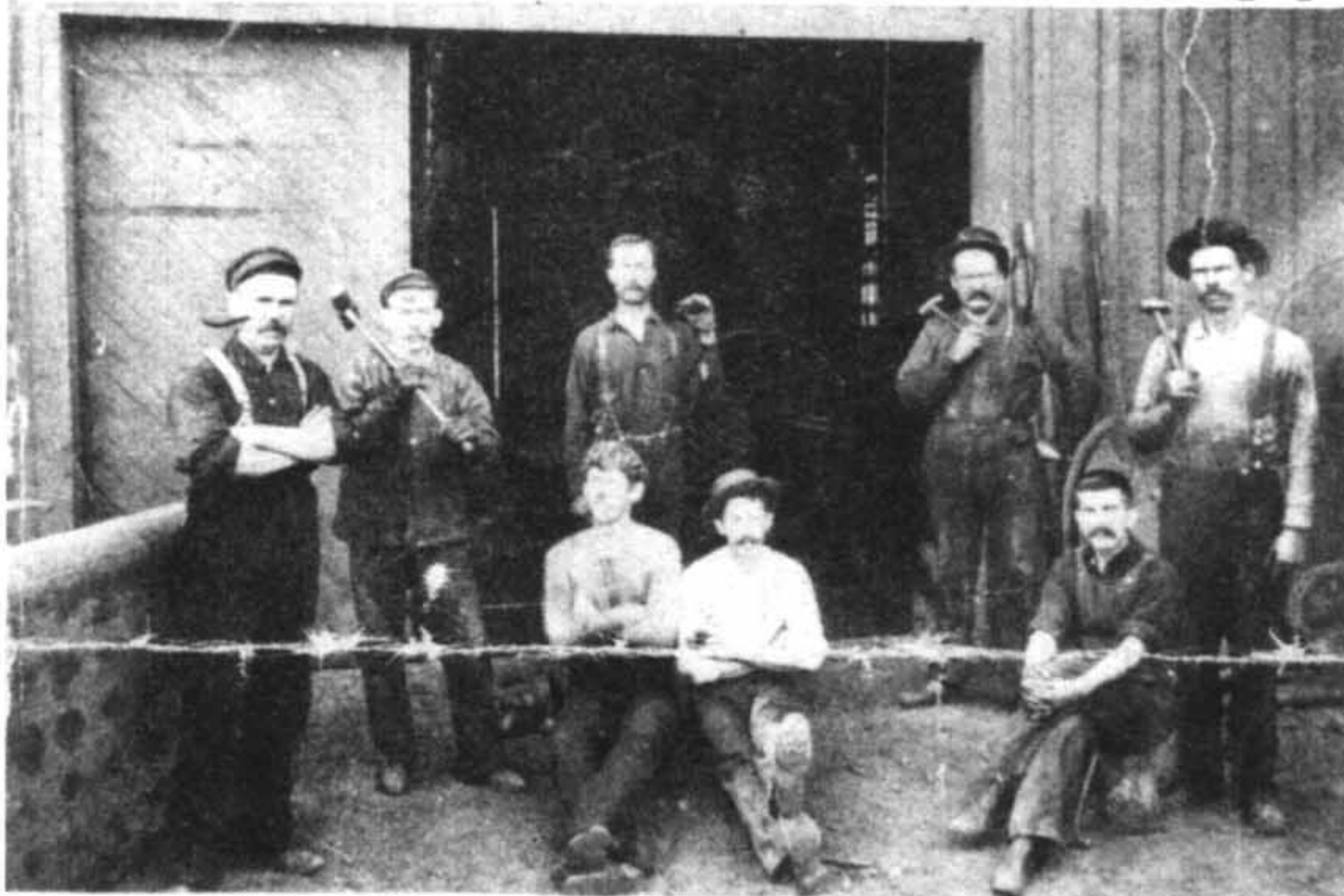
BELOW: A fine bit of work turned out in the shops. It furnished the power for a threshing machine, burned bean straw for fuel.