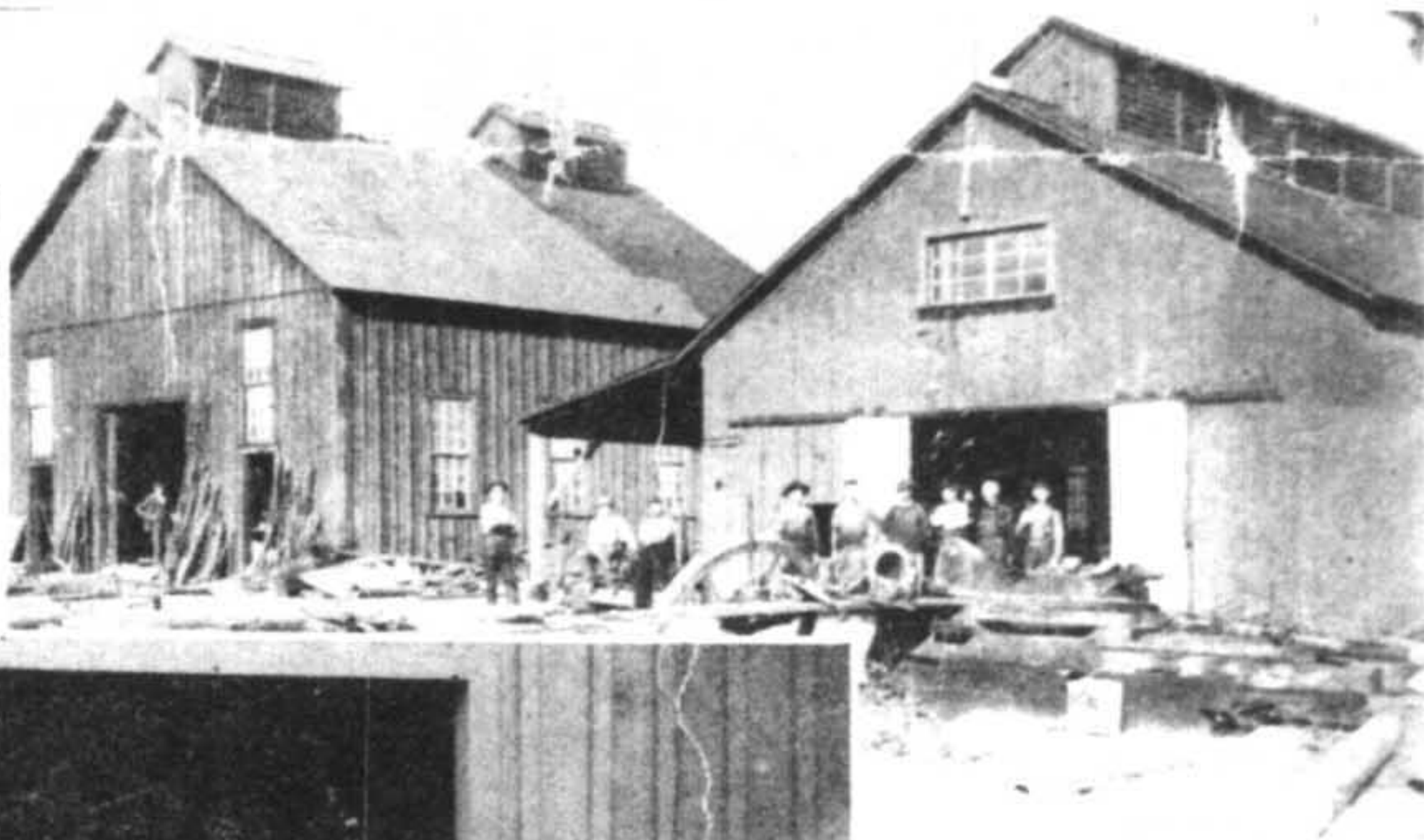
RIGHT: Here are the old blacksmith and machine shops as they looked in 1891. The crew waits patiently for a 3-minute exposure.