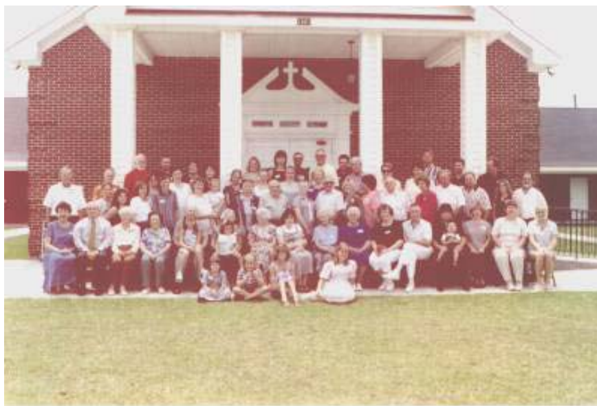
Ballentine-Huxford Family Reunion - 2000