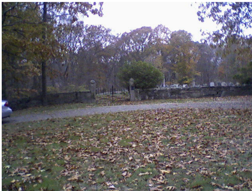
Entrance to Wightman Burying Ground

Despite these early setbacks, the small church continued to flourish and (albeit at a different site today) celebrated its 300th year of existence in November of 2004.