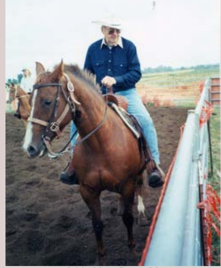
Added by: Bonzo32