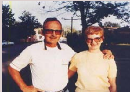
Added by: Bonzo32