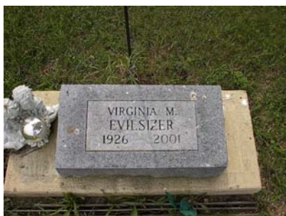
Hillcrest Cemetery, Jay County, Indiana (No SSDI info, no obit located yet)