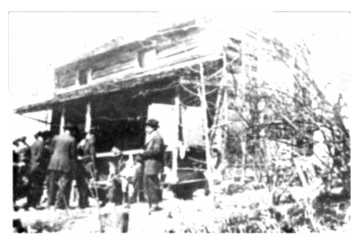
"Where Granny Lived" Built 1772 by the Flenniken family, early pioneers