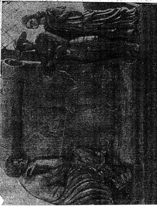
piece representing maps of the U.S.-Canada unpatrolled borders. Figure on left represents aristotle, symbol of Democracy. Figures on right representing Royal Canadian Mounted Police Miss Liberty. Presentation will be made in Washington by Secretary of State Dean Rusk to da's Secretary of State for External Affairs, Paul Martin.