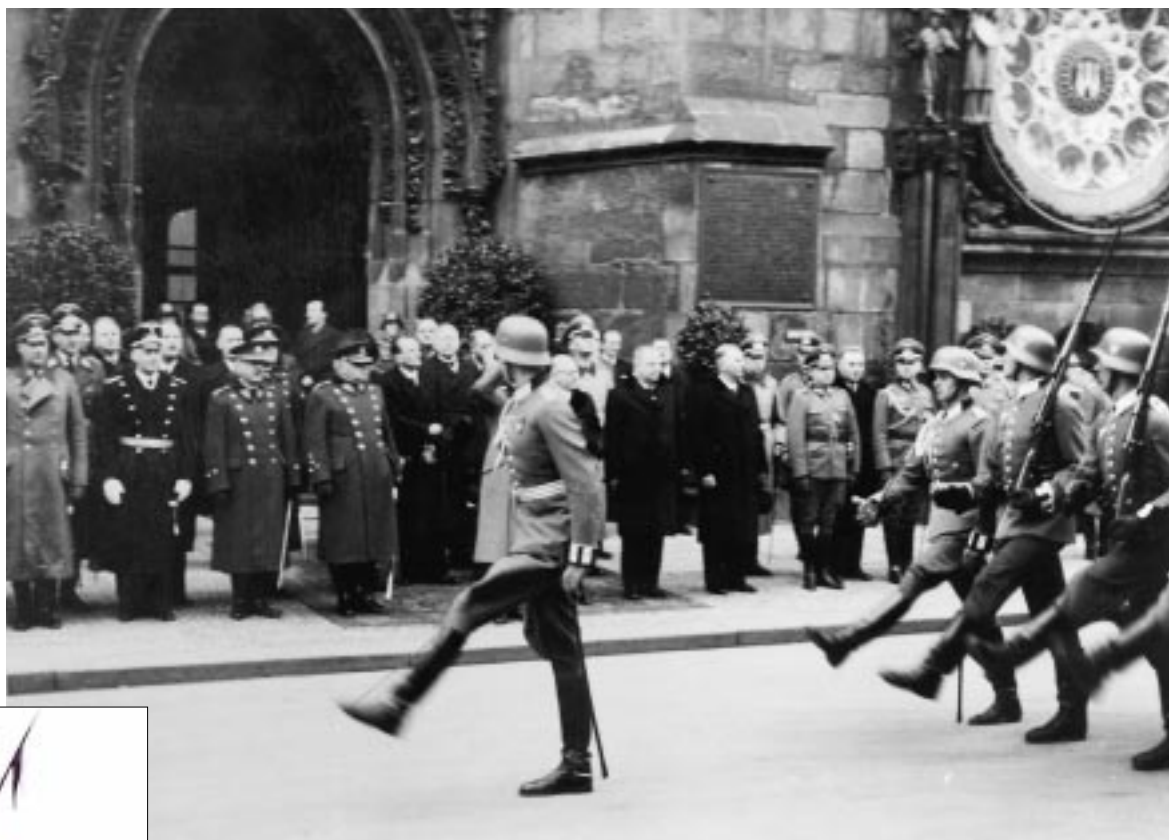
Naval Historical Center