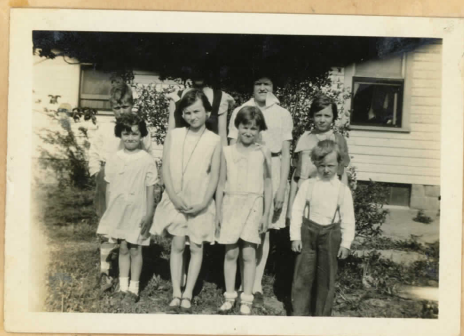
The Gang of the Neighborhood 1932