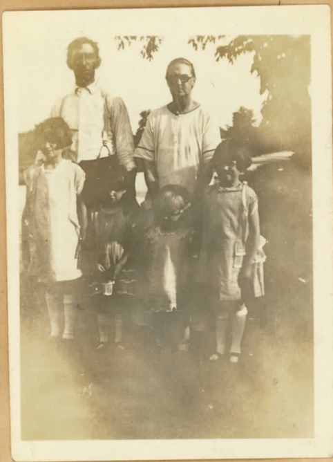
The four girls—and their Grandparents. Summer of 1925