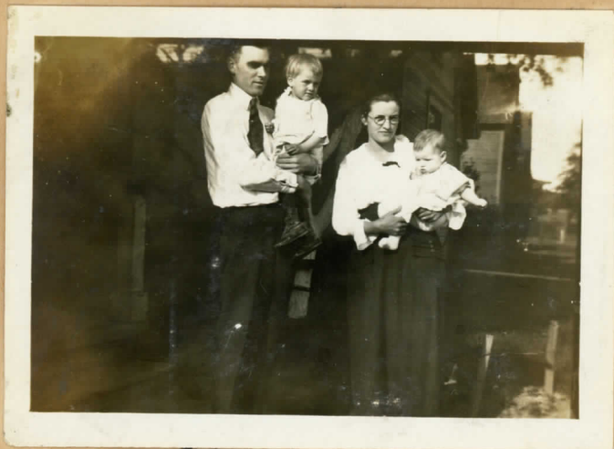
The Family in 1920