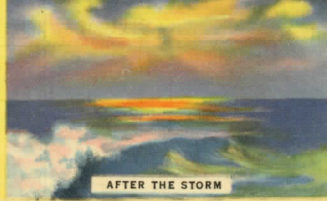
AFTER THE STORM