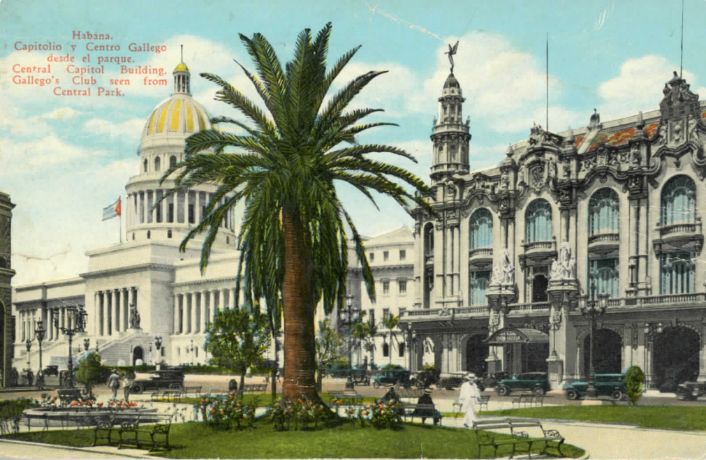
Habana. Capitolio y Centro Gallego desde el parque. Central Capitol Building, Gallego's Club seen from Central Park.