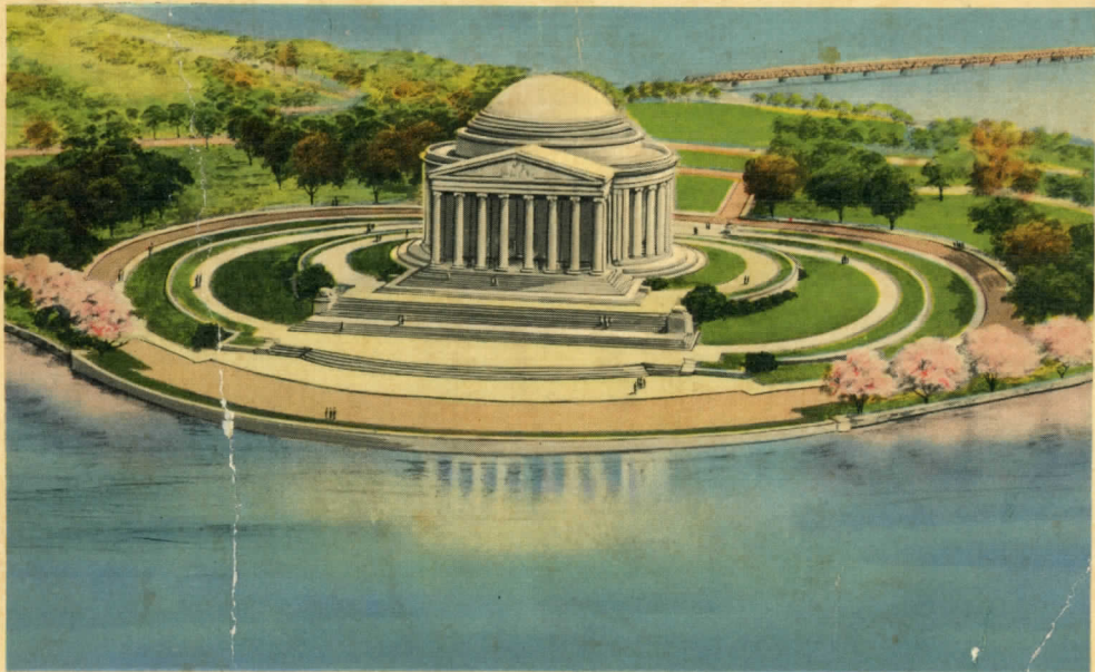
M581:—THOMAS JEFFERSON MEMORIAL, LOWER END OF TIDAL BASIN, WASHINGTON, D.C.