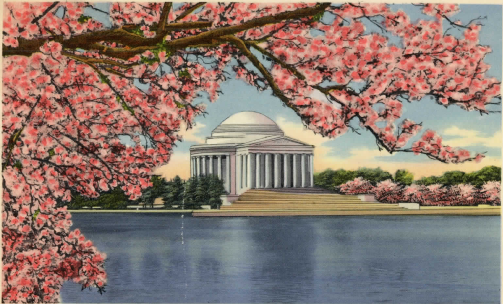
Jefferson Memorial, Washington, D. C.