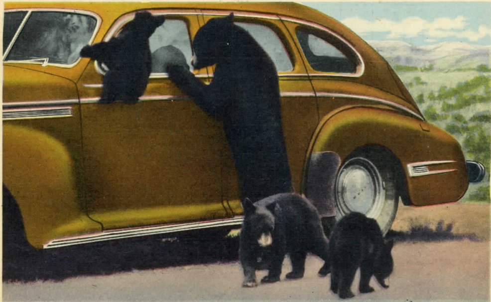
A-6—Bears in the Great Smoky Mountains National Park