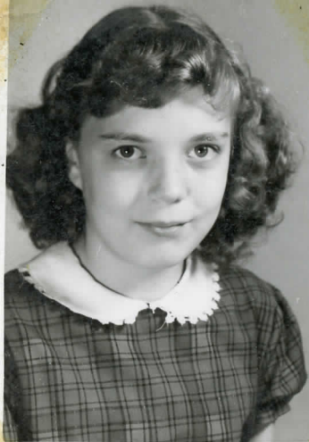
SCHOOL DAYS 1954'-55 Daleville Elem.