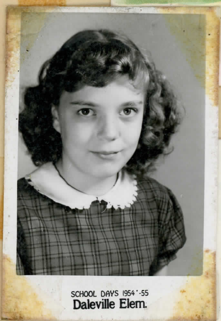
SCHOOL DAYS 1954-'55 Daleville Elem.