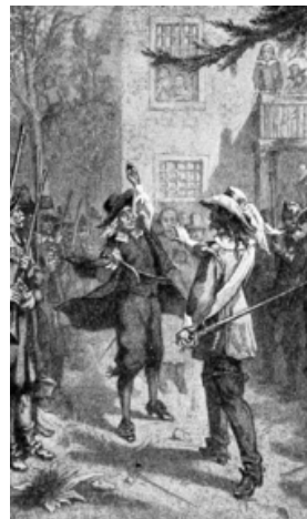
Nathaniel Bacon (at right) demanding his commission from Governor Berkeley