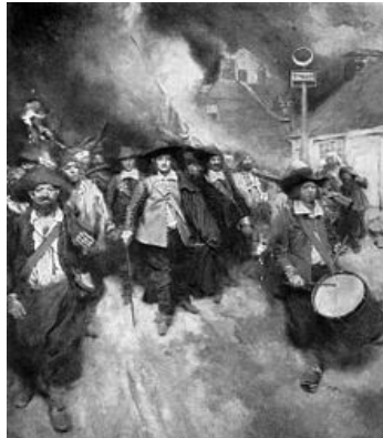
The Burning of Jamestown by Howard Pyle, ca. 1905.