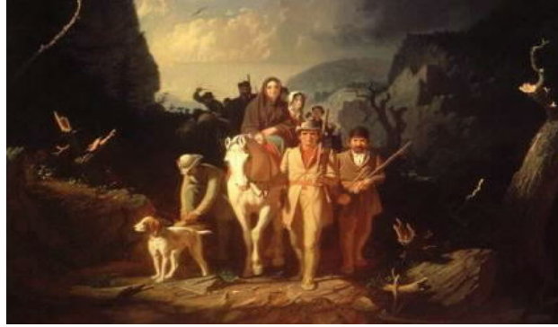
George Caleb Bingham's famous painting depicts pioneers traveling through the Cumberland Gap of the Virginia.

toward the cheaper lands in Virginia. Crossing the Potomac River by Williams' or Watkins Ferry, near the later site of Williamsport, they followed the narrow footpath along the Shenandoah River. Past occasional clearings in the forest of the Valley of Virginia, they came after many days' journey to a gap in an earlier trail, named Buffalo Gap. There, seventeen miles southwest of the valley near a way station that would eventually grow into the town of Staunton, and later the county seat of Augusta county, Virginia, they cleared land and began to develop a farm.