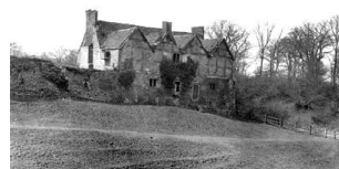
Hartshill Castle as it looked in 1927