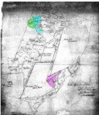
1789 Zachia Manor Survey showing Moreland property http://tinyurl.com/7n8pb98