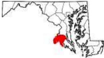
Charles County, Maryland http://tinyurl.com/6nlyko3