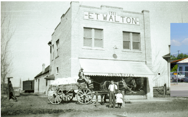
Store operated by ET Walton (after 1911 remodel).